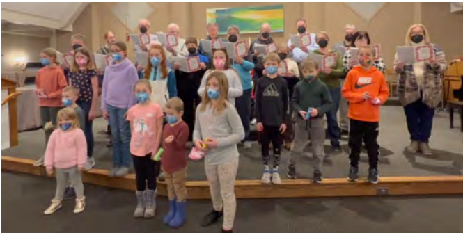
Combined Youth and Adult Choirs